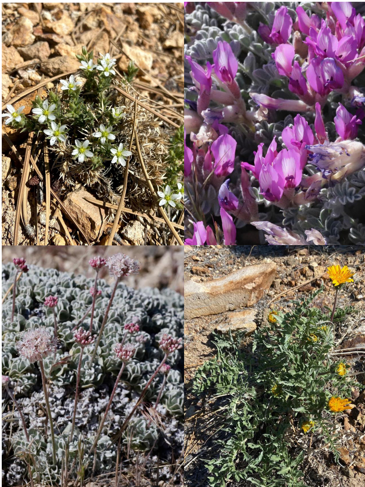
Top left: Eremogone kingii ( Arenaria ) Top right: Astragalus purshii - woolypod milkvetch Above left: Eriogonum Ovalifolium var. williamsiae - Steamboat buckwheat Above right: Balsamorhiza Hookeri