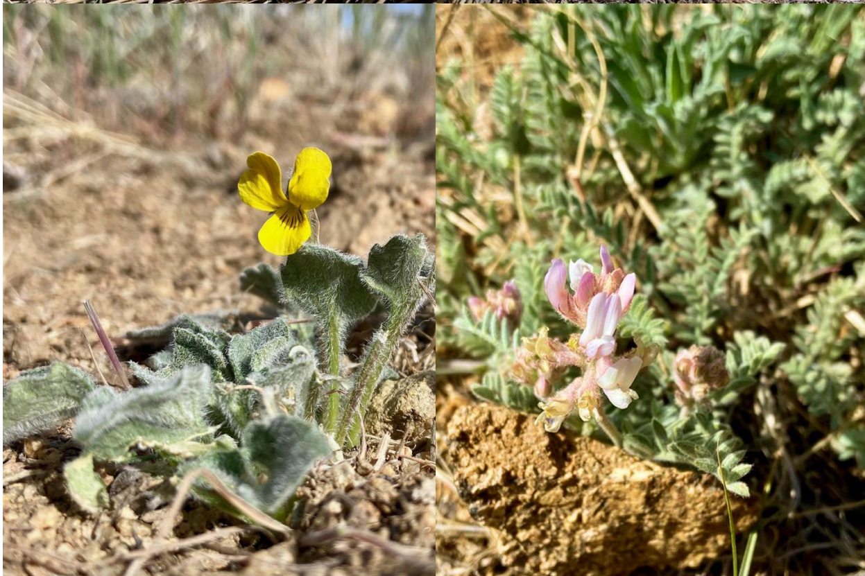
Top: Balsamorhiza sagittata - arrow-leaf balsam root