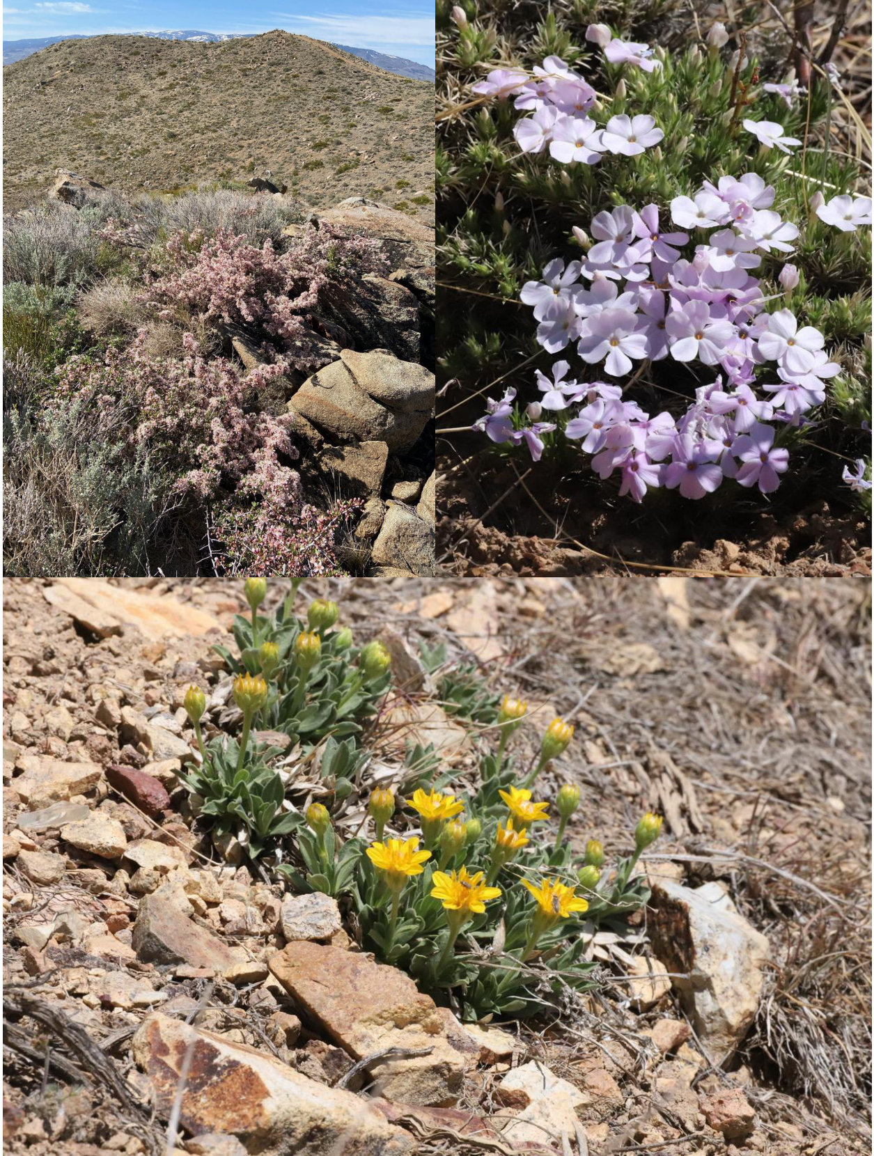
Top left: Prunus andersonii - desert peach Top right: cushion phlox Above: Stenotus acaulis